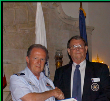
THE AUXILIARY'S NATIONAL CHIEF OF STAFF